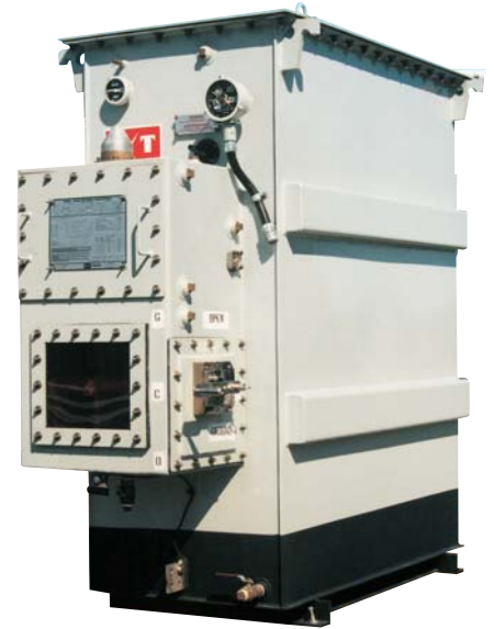
750 KVA 13.8kV \Delta -208Y/120V Network Transformer

A VARIETY OF ACCESSORIES ARE AVAILABLE IN ORDER TO MATCH CUSTOMER SPECIFICATIONS.