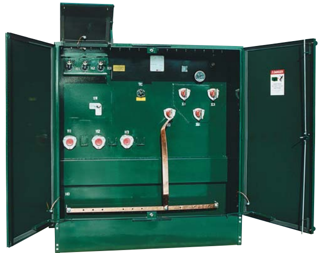
1500KVA Dead Front Radial Feed 3 phase Pad-Mounted 24.9kVGY/14.4 kV - 600Y/347V