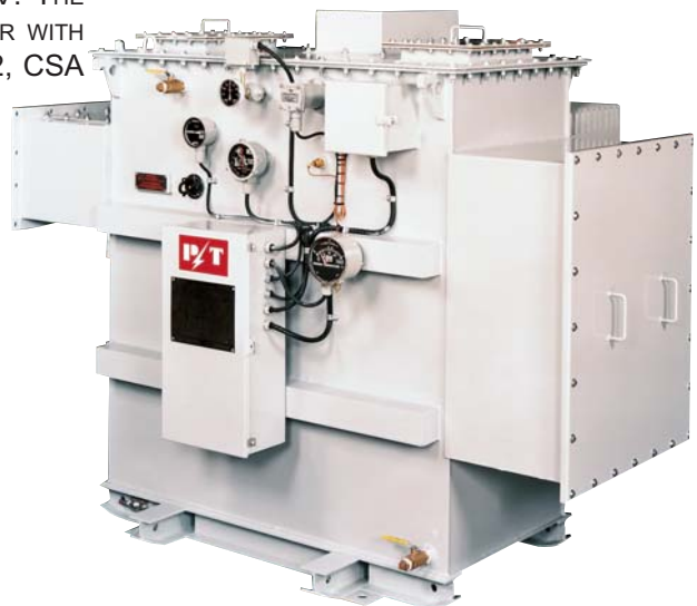
2 MVA 13.8kVΔ-600Y/347V 3 phase Small Power